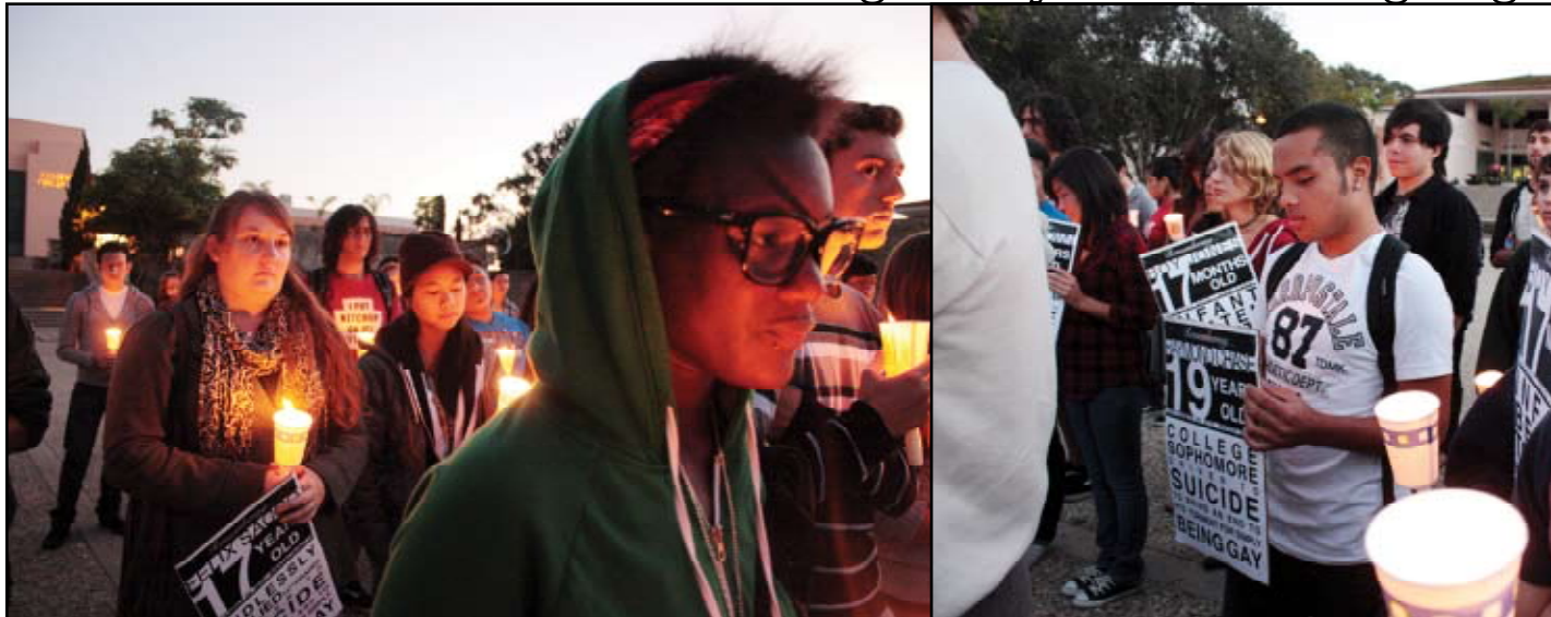
CANDLELIGHT VIGIL — Students came together to pay respects to recent suicide victims.

Birth Of An Allied Generation: National Coming Out Day and The Candlelight Vigils