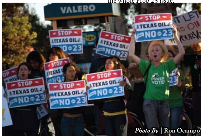
AGAINST PROP 23 — Students protest outside of the local Valero.