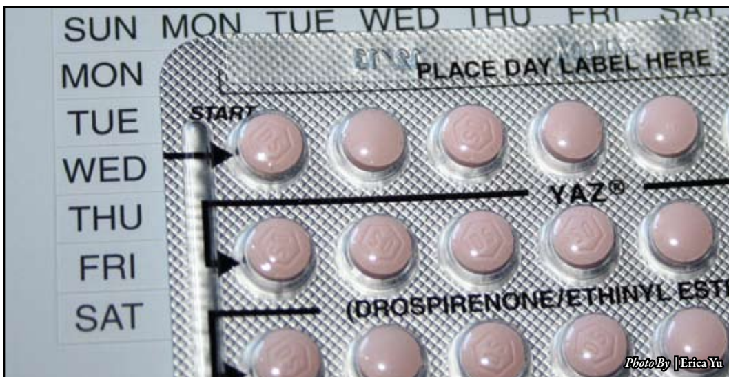
YAZ — A popular brand of oral contraceptive.

Coming in at fourth are the Pill, the Minipill, the Patch and Nuva Ring, all with a reported failure rate of 0.3 percent in the first year. The ever-popular "Pill," also known as the "Combined Pill," is so aptly named because it contains both progestogen and estrogen, as compared to the Minipill, which contains only progestogen. The obvious disadvantage of the Pill is that it needs to be taken every day, preferably at the same time each day, and missing even a single dose can allow hormone levels to drop long enough to en-