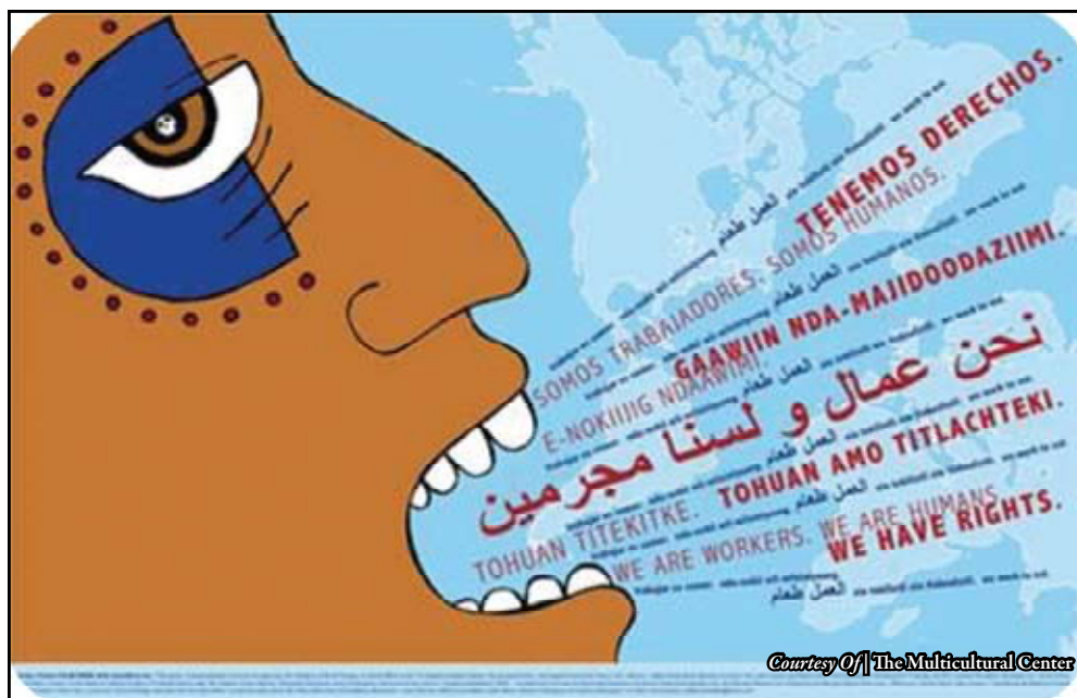
THE POWER OF ART — A poster by Dylan Minor, designed to communicate and inspire to action.