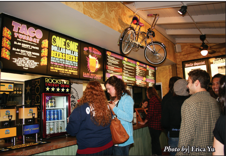
CHINOS — Come sample their new fare.