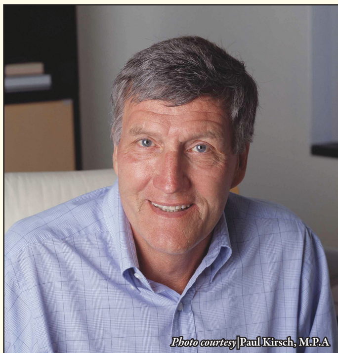
DR. ERKKI RUOSLAHTI— Discovers a new peptide.