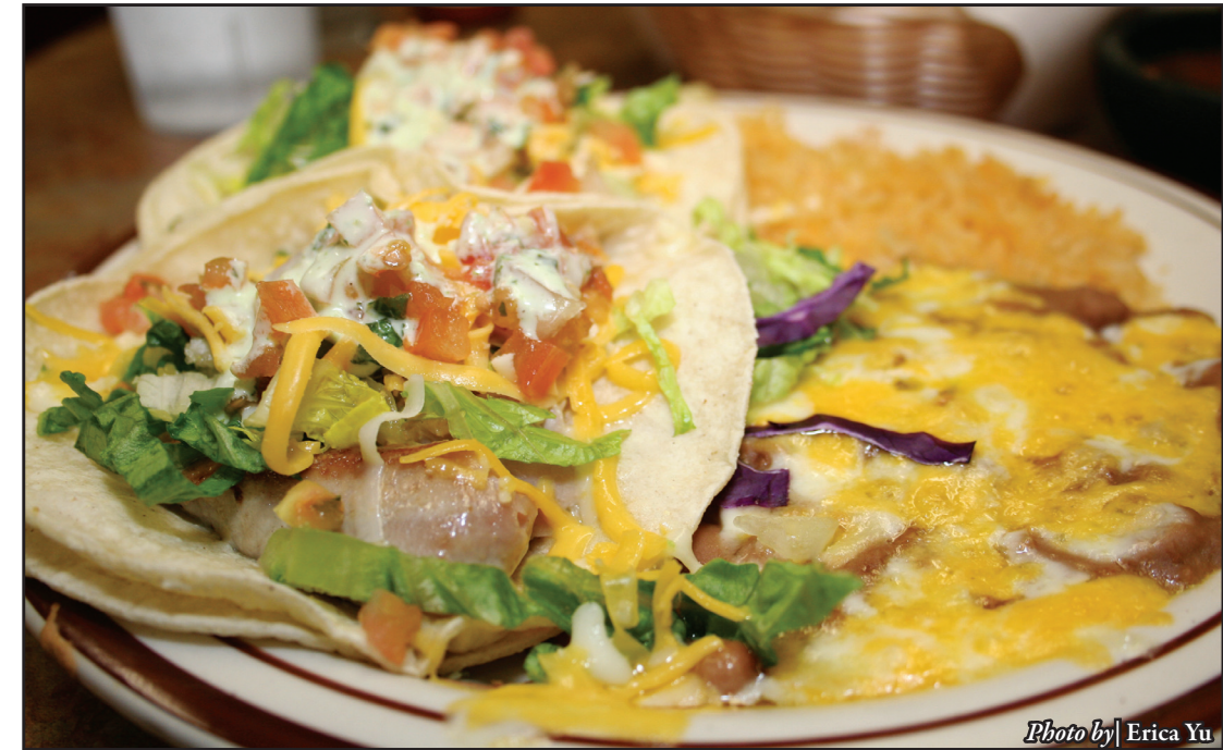
TACOS — Grilled Mahi tacos with rice and beans.

Chino's offers a wide selection of choices and weekly specials. The colorful Specials Menu alerted me to weekly events